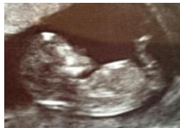
(Not to scale)